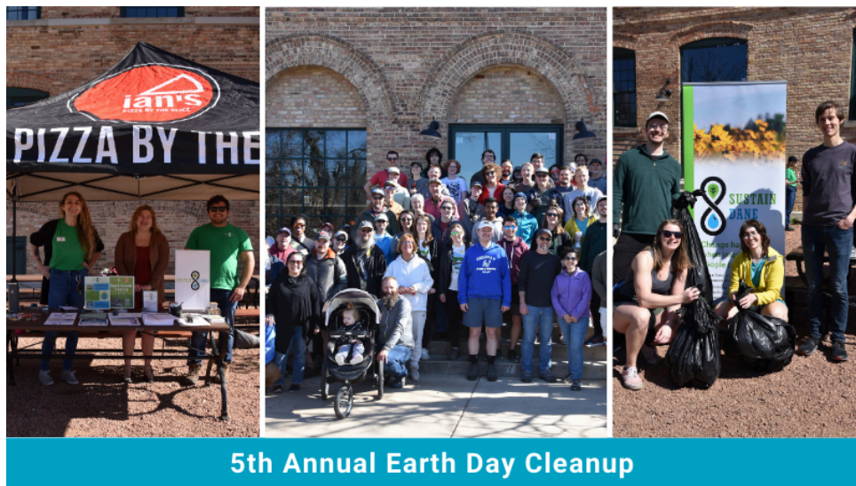
5th Annual Earth Day Cleanup