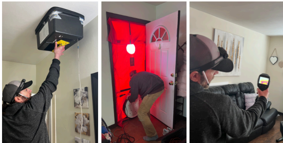
Efficiency Navigator Work in Action

Interested in becoming a member? Learn more and sign up online. Members receive complimentary access to Sustain Dane programs and other benefits, while also supporting Sustain Dane to continue our work in the community.