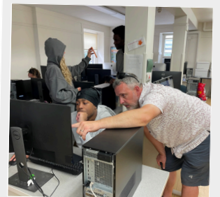
26 On-Site Experiences