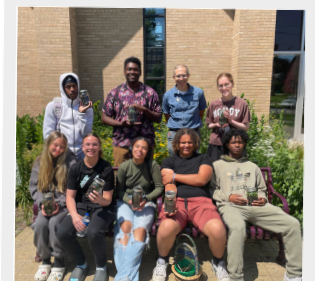
36 Youth Participants