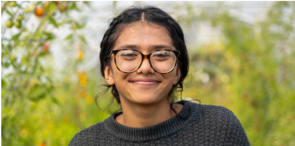
Welcome to Sonali

Sustain Dane is the sustainability organization of Dane County. Join us and get involved in accelerating community well-being.