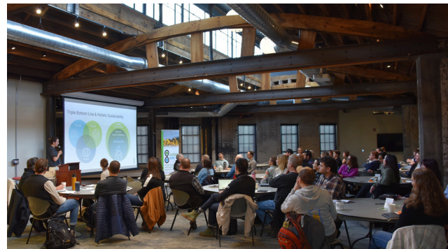
Participants at the 2025 Accelerate Sustainability Workshop.

Aldo Leopold Nature Center American Family Insurance APTIM Attic Angel Community BBEC Services City of Madison City of Middleton Current Electric Dane Buy Local Dane County Office of Energy & Climate Change DC Engineering Delta Beer Lab designCraft Advertising EUA Everlight Solar Exact Sciences FairShare CSA Coalition Fleet Feet Madison Greater Madison MPO Green Box Compost Green Notes HCG-Madison Holy Wisdom Monastery Hotel Indigo