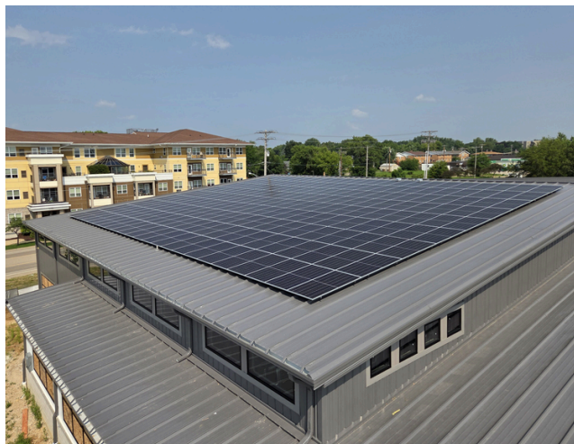
The solar array on the new River Food Pantry building.

These priorities in the new building enriches River Food Pantry's efforts to build a stronger community, inviting all who visit to reflect on the importance of creating a resilient and environmental conscious future.